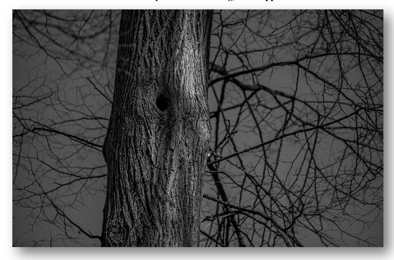
Episode 135: Wherein Crazy Man and the Dog Sidestepper, play the guessing game.

(New here? Click here to see what it's all about.)